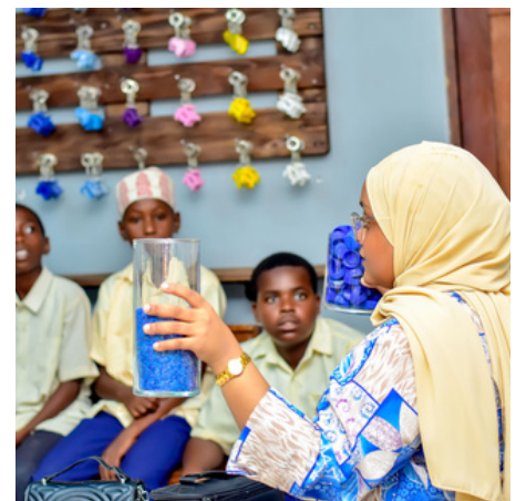
REaching out to school children of Zanzibar on plastic pollution