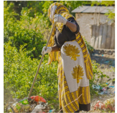
REmoving Taka taka from the environment