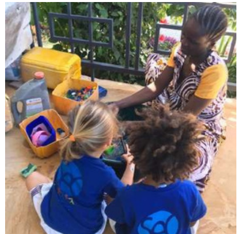
Joining the fight by empowering women