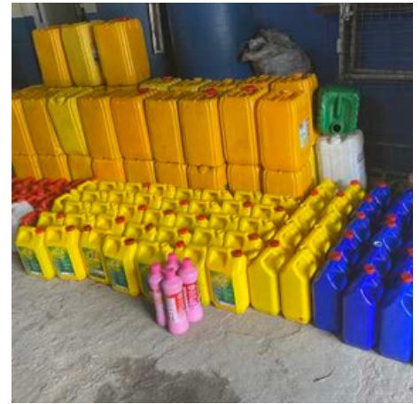
Regular delivery from 1 hotel

We have a very long wish list for all kinds of tools and equipment. We always need good quality heat resistant gloves starting from US$5. Should you wish to join our fight by donating, please get in touch stating the amount you wish to donate and we will advise what PPE, tools or equipment we can buy from your donation.