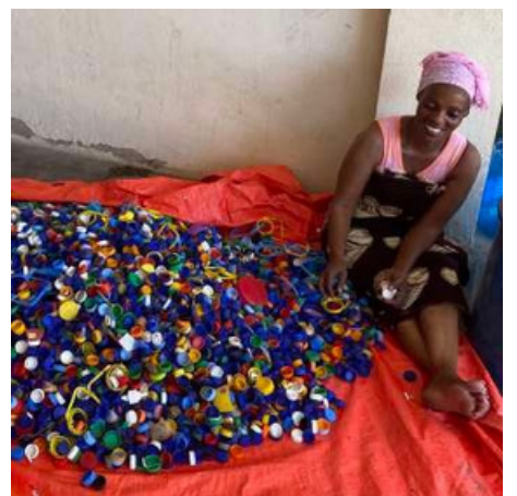
Separating bottle caps by colour