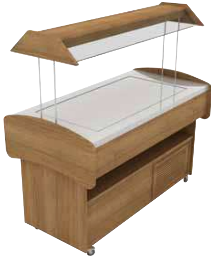
SBEC 02 Economic Salad Bar With Plate Wooden Surface COLD