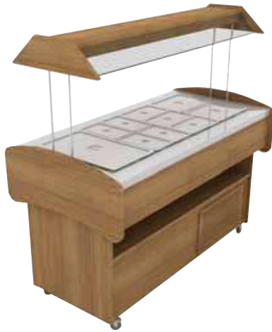
SBEC 01 Economic Salad Bar With GN Cells Wooden Surface COLD