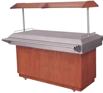
OSBN 15894 CE ENEC Neutral Service Unit (Wood) NOTR

Pool is heated with heating elements located under the pool. 4 pcs. GN 1/1-150 capacity, wheels. Digital thermometer thermostat.