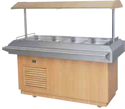
OSBE 16894 CE ENEC TÜV-CB Salad Bar Without Underneath Refrigerator (Wood) COLD

Wooden underneath. Foldable service bar. Cooling pool runs with static system. Top light, 4 pcs. GN 1/1-150 capacity, wheels.